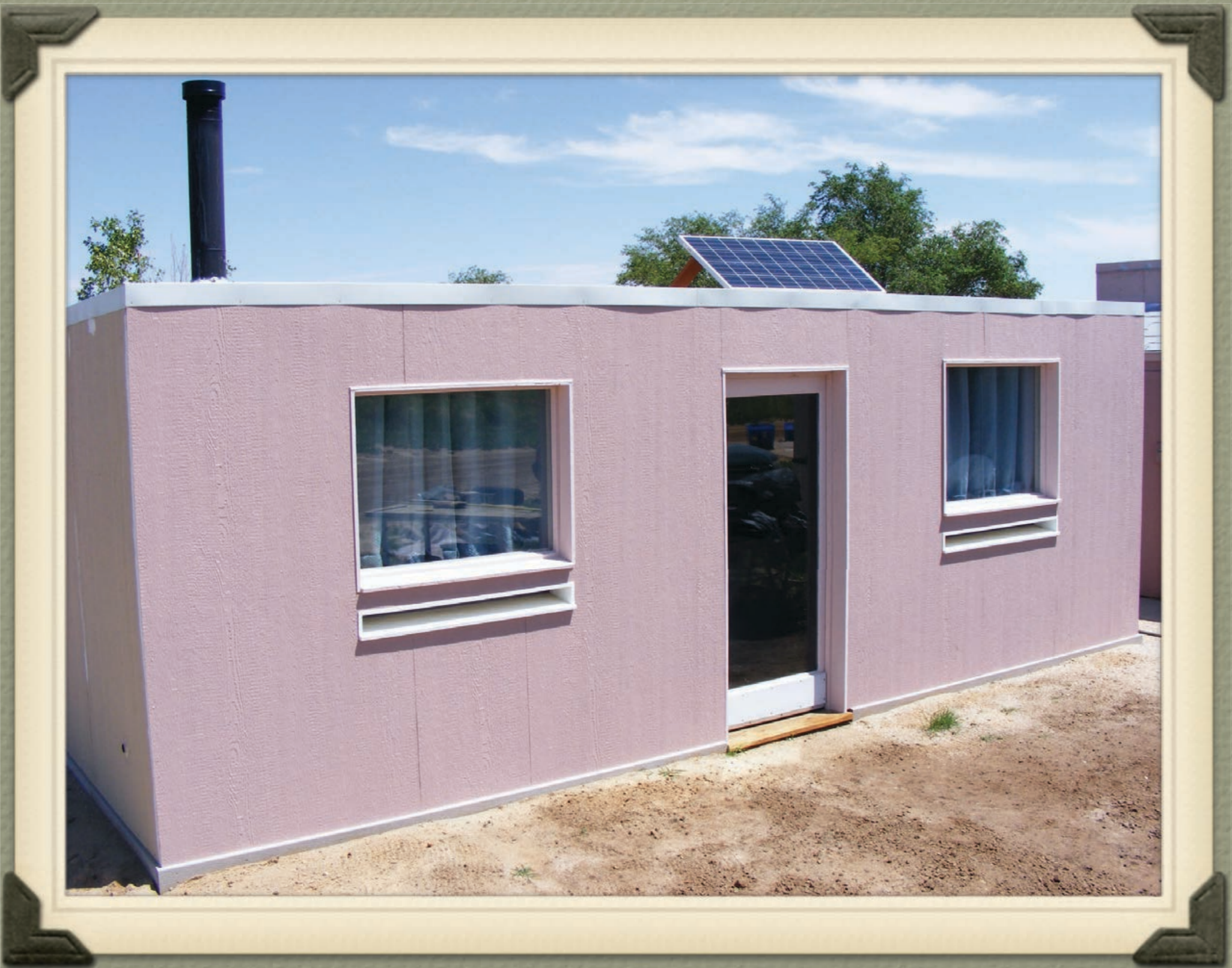
THE BUNK HOUSE