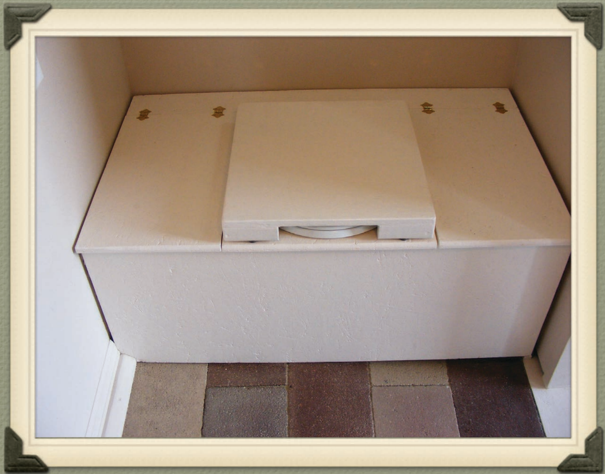
This is a sawdust toilet. It has two 12-volt fans for odor control.