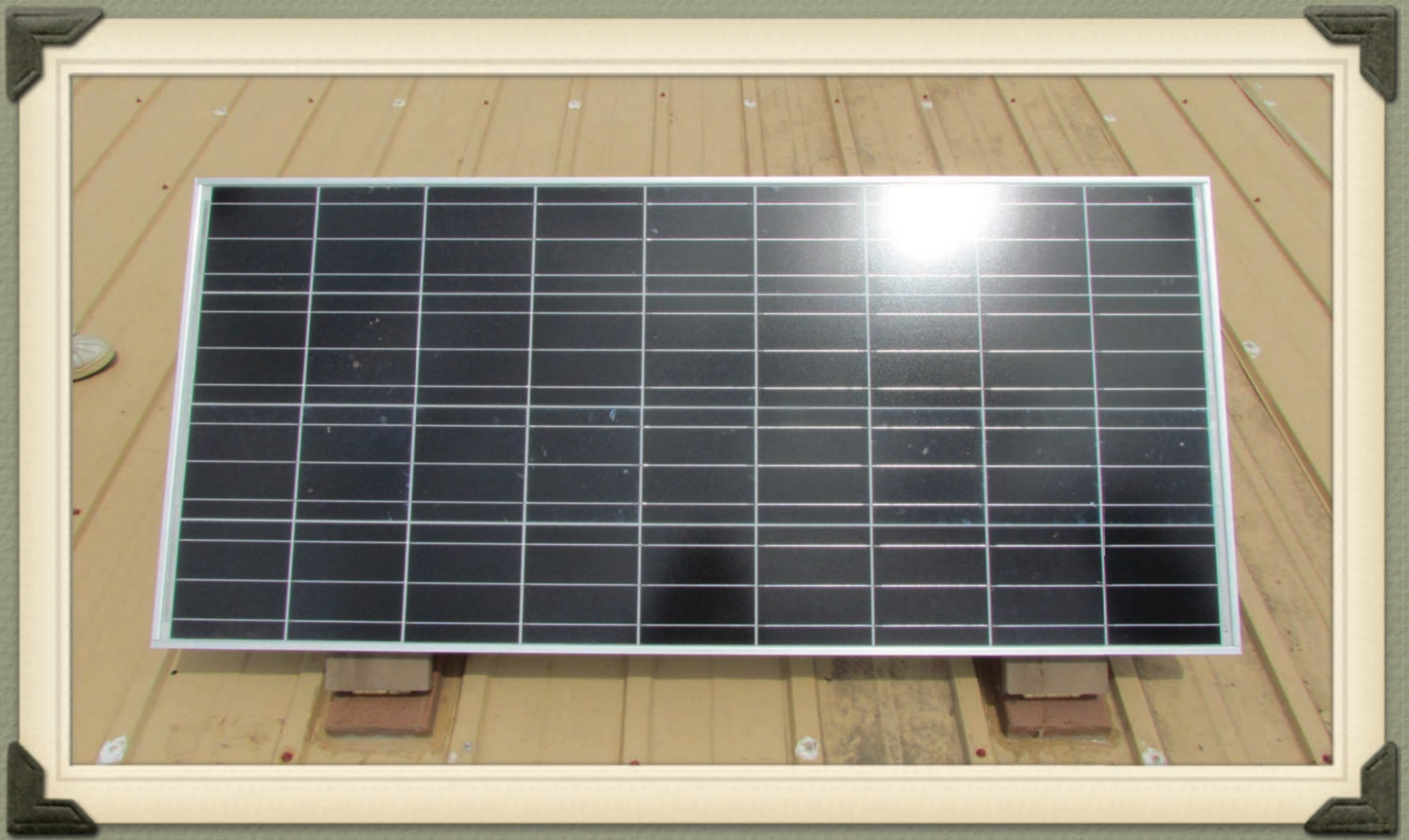
The Solar Electric System